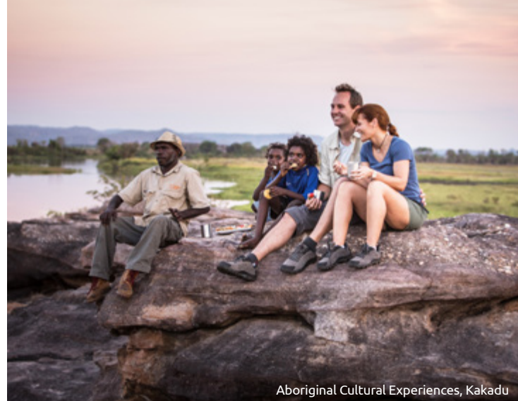
Aboriginal Cultural Experiences, Kakadu