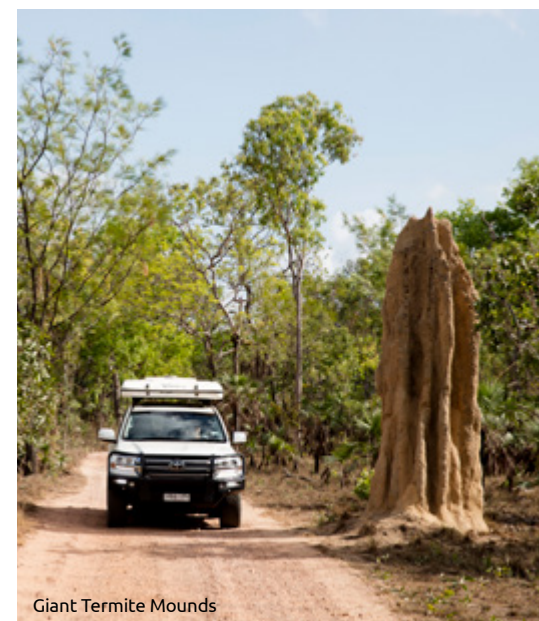
Giant Termite Mounds