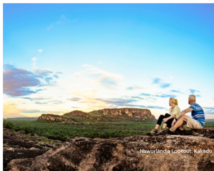
Nawurlandja Lookout, Kakadu