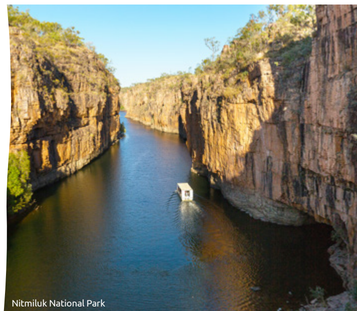
Nitmiluk National Park