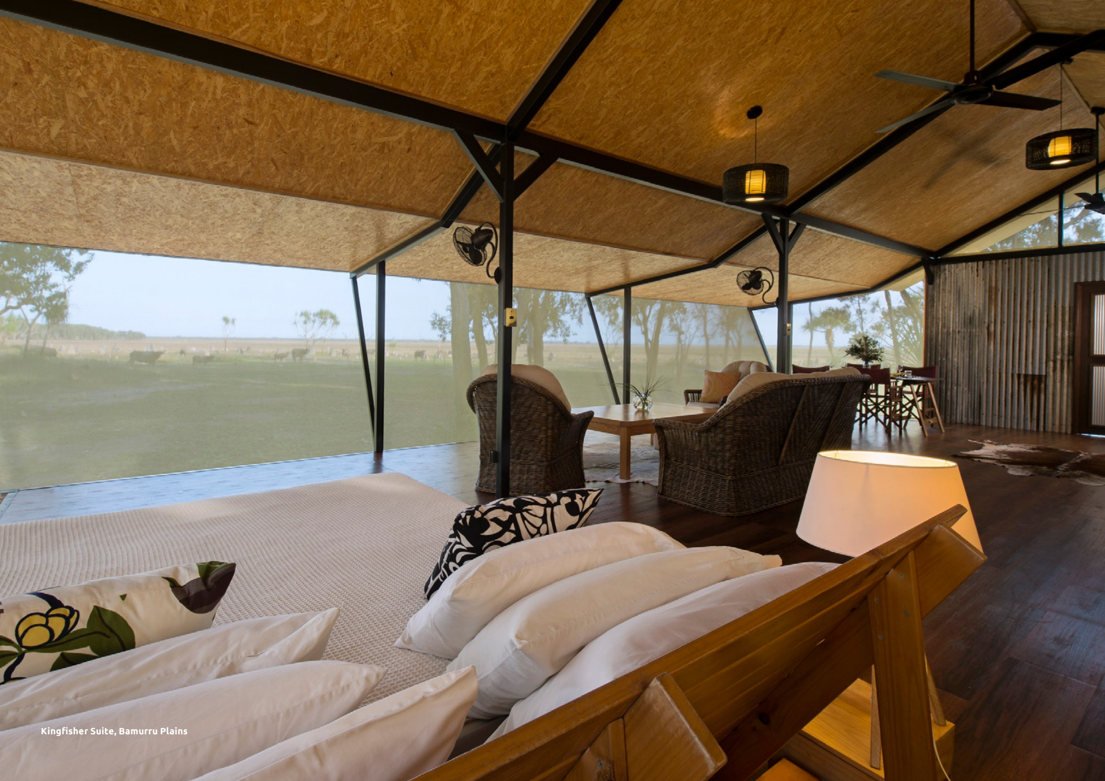
Kingfisher Suite, Bamurru Plains