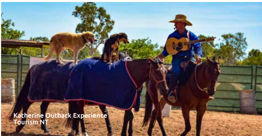
Katherine Outback Experience Tourism NT

are available with Nitmiluk Tours , Coolibah Air , or Katherine Aviation . Another great way to see this country is on foot. There are plenty of short trails to follow over the sandstone plateau.