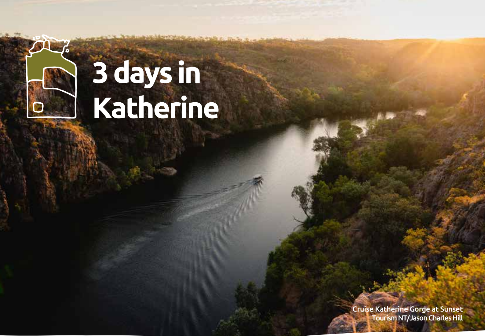
Cruise Katherine Gorge at Sunset

This three-day itinerary explores local gorges from the water and the air; Aboriginal culture, and outback life, showing that this region is a perfect holiday destination for travellers with a thirst for adventure.