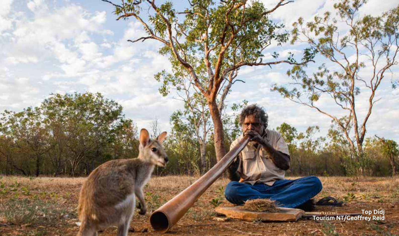
Top Didj Tourism NT/Geoffrey Reid